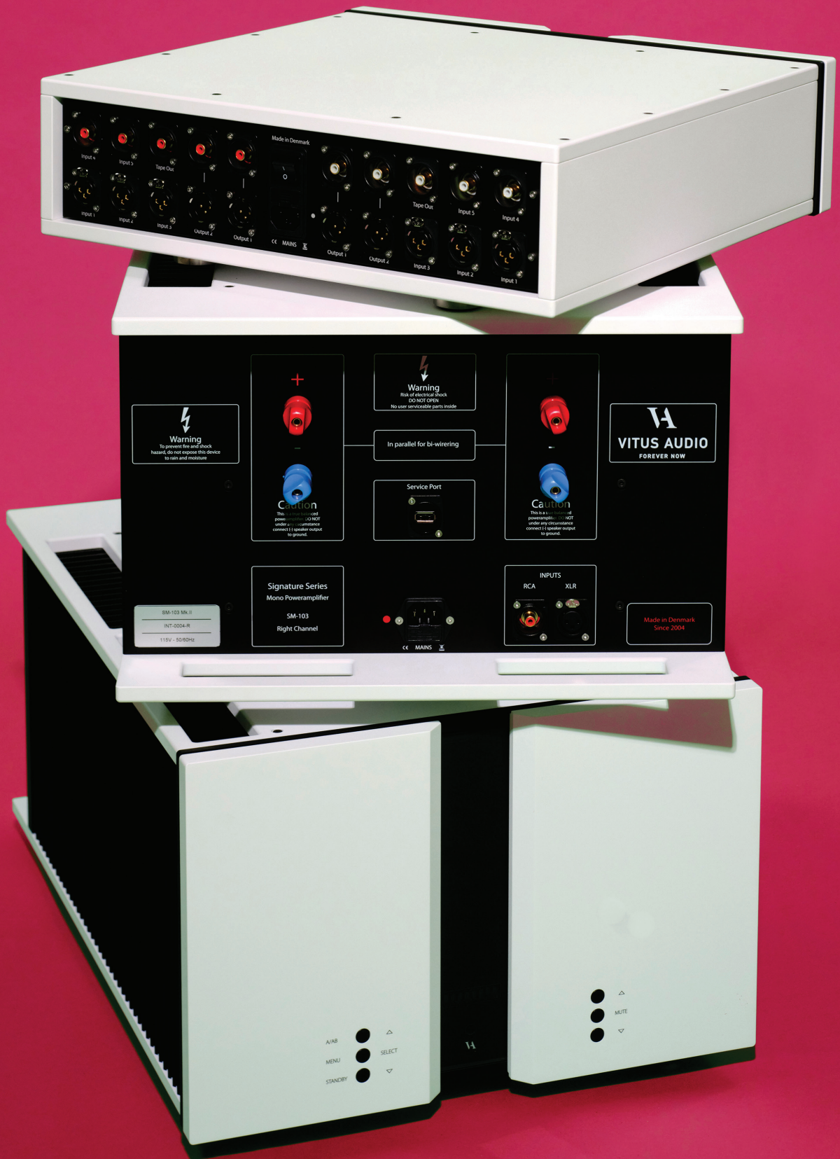
Vitus Audio Signature Series SL-103 Linestage Preamplifier and SM-103 Mk.II Monoblock Power Amplifiers